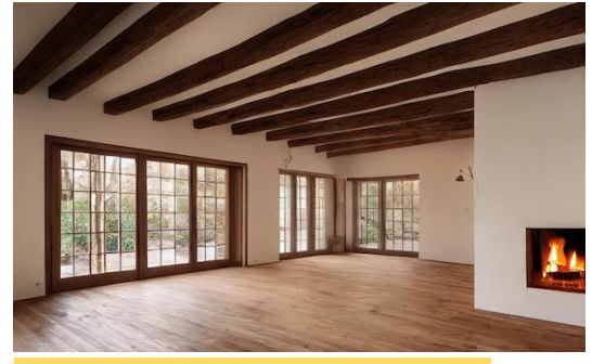
ceiling beam, woodstove, hearth