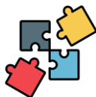
jigsaw puzzle (e)