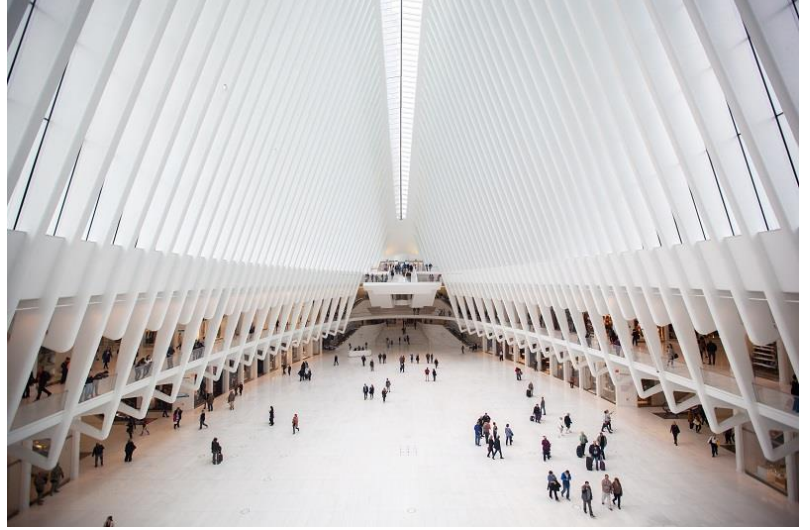
The Oculus (artistic landmark/shopping centre)